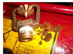
Corrosion removed from deluge nozzle