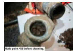
Corrosion Product in deluge pipe