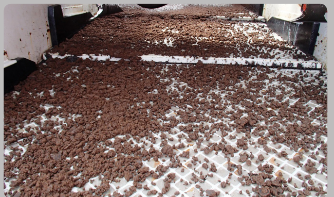
Wax Removal from the Production flowline