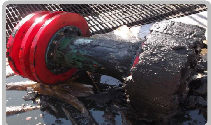
Image of stuck pig from 92 km onshore pipeline.