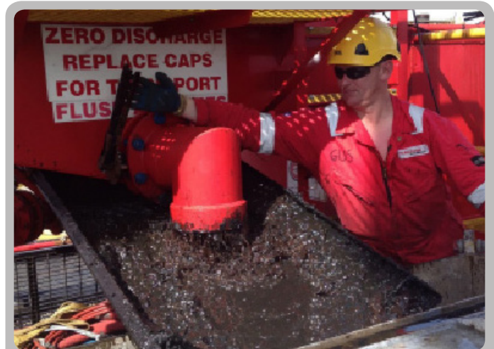
Wax Removal from the Production flowline